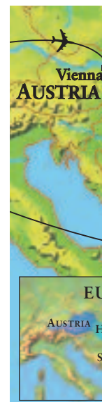
Join the Vienna Pre-Program Option and discover the imperial treasures of the city's Habsburg past, including the Hofburg Palace, now the official residence of Austria's president.