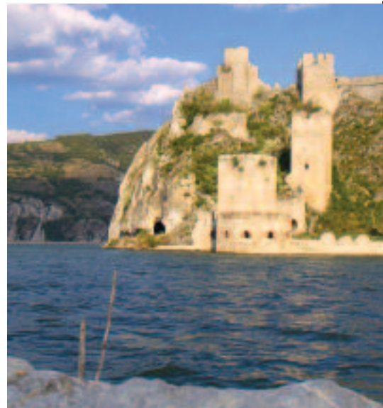
The Ottomans, Hungarians, Austrians and Serbians battled at Golubac in Serbia, strategically located at the gateway to

Set out to survey this city of Byzantine emperors and Ottoman sultans on the special, guided afternoon tour. Marvel at the beauty and grandeur of the Hagia