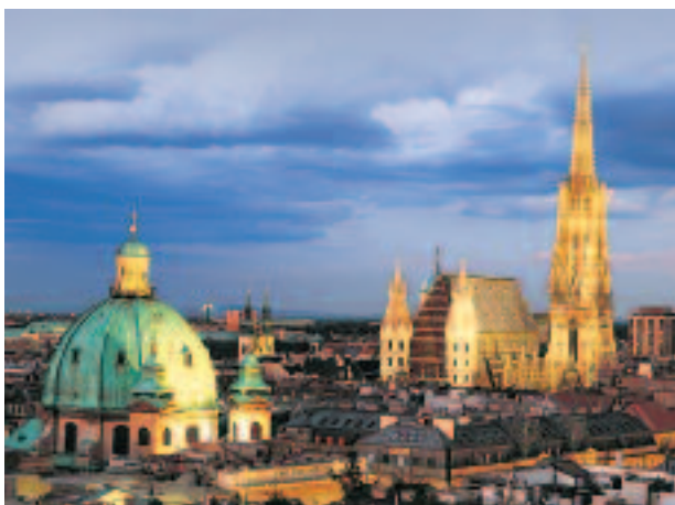
Its soaring spire and multi-colored tiled roof make St. Stephen's Cathedral Vienna's most beloved landmark.