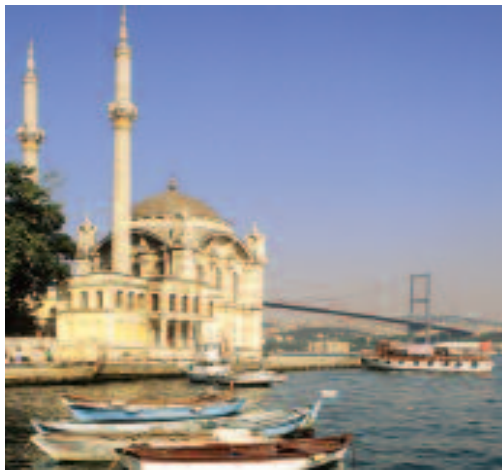
Flanked by the elegant Ortaköy Mosque, the Bosphorus Bridge is a modern symbol of Istanbul's age-old status as a crossroads of Europe and Asia.