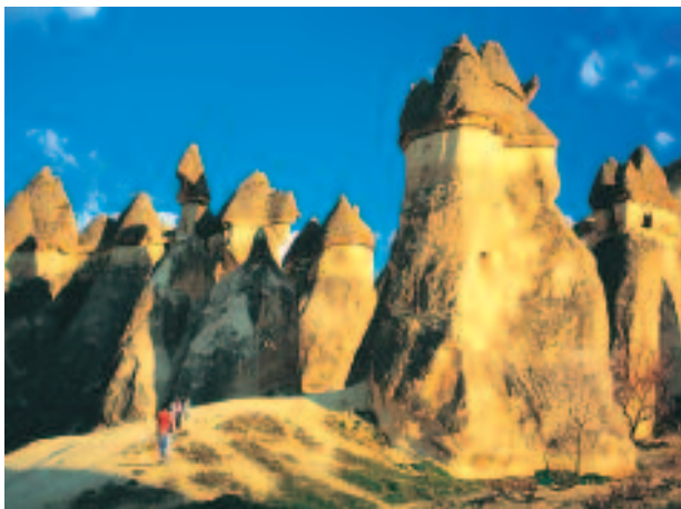
Step into a fascinating world like no other in the towering volcanic stone forests of Cappadocia.

Join this exceptional three-night extension to the mesmerizing landscapes of Cappadocia, a UNESCO World Heritage site and one of nature's most captivating and unique treasures. Stay in the elegant Cappadocia Cave Resort in Göreme National Park. Explore ancient churches carved into the region's famous volcanic rock formations, visit typical Cappadocian villages, tour a traditional winery and learn about the region's distinctive culture, which traces its roots to Biblical times. Complete details will be provided with your reservation confirmation.