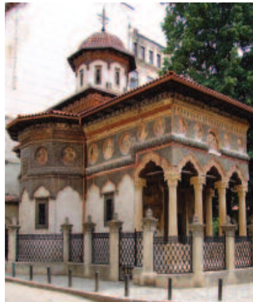
1721, the diminutive Stavropoleos Church is an elegant and European architectural styles.

Sophia, the crowning achievement of Byzantine architecture, consecrated as a basilica in A.D. 537 during the reign of Justinian. Later converted into a mosque, it is widely considered the finest Byzantine monument in the world. Stop at the spectacular Blue Mosque, a classic example of 17th-century Ottoman architecture. One of the few mosques in the world with six minarets—a symbol of the Ottoman sultan’s vaunted power and prestige—it was so named for the lustrous blue Iznik tiles that adorn its interior. At the site of the Byzantine-era Hippodrome, see where crowds cheered on chariot racers in the most prestigious arena in the Byzantine world.