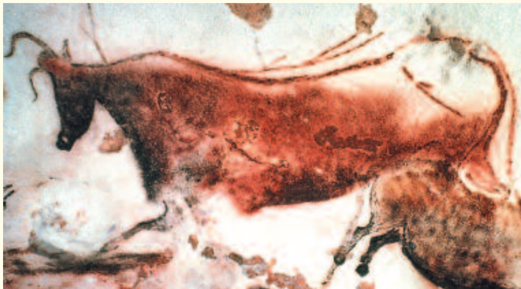
Marvel at the exquisite artistry of prehistoric painters in the cave of Lascaux that is not only unsurpassed in its scope and beauty, but offers unparalleled insight into the world of our ancient ancestors.

On the ancient estate of the Manor of Eyrignac in the rolling hills northeast of Sarlat, discover what many consider the finest gardens in all of France. Originally designed as an Italian garden in the 18th century, the grounds were converted to an English-style romantic garden in the 19th century and have been immaculately preserved and enhanced through the years. Though they contain virtually no flowers, the gardens’ harmonious blend of evergreens—primarily box, hornbeam, cypress and yew—has been meticulously designed and landscaped to create a dazzling display of beauty. Designated a national monument by the French government, the Manor of