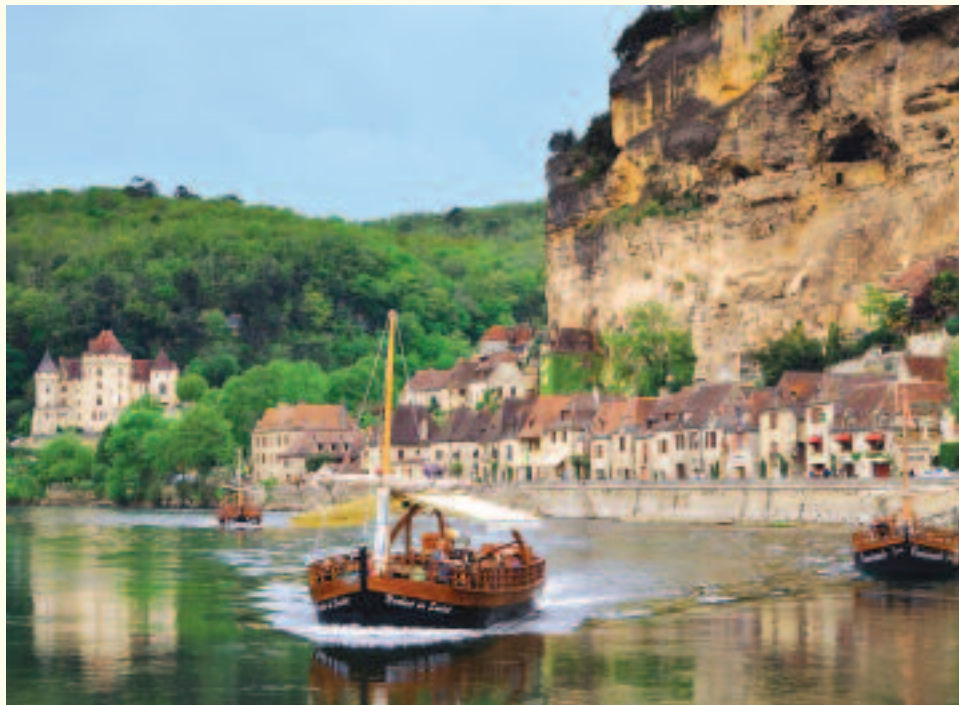
Sail the bucolic Dordogne River aboard a traditional wooden gabare, the typical mode of transportation of the Périgord region for more than 150 years.

Unpack once! This exceptional travel opportunity includes all accommodations, meals and exclusively arranged excursions for an incredibly attractive price. Come experience a special way of life: VILLAGE LIFE IN DORDOGNE.