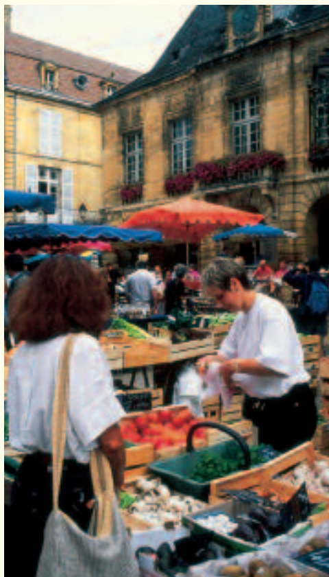
Experience Sarlat-la-Canéda's twice-weekly market, a medieval tradition in the heart of the village.

We invite you to join the exclusive two-night Pre-Program Option in Bordeaux. An ancient port at the heart of the French wine trade, this delightful city is renowned for its elegant boulevards and classic 18th-century architecture, yet it remains largely undiscovered by Americans. Enjoy accommodations in Hotel Burdigala , located in the heart of the city. Visit the city's most important landmarks on the guided walking tour and set out on an excursion to Ecole du Vin de Bordeaux and the Graves wine region for an introduction to the art of French wine making and a tasting. Complete details will be provided with your reservation confirmation.