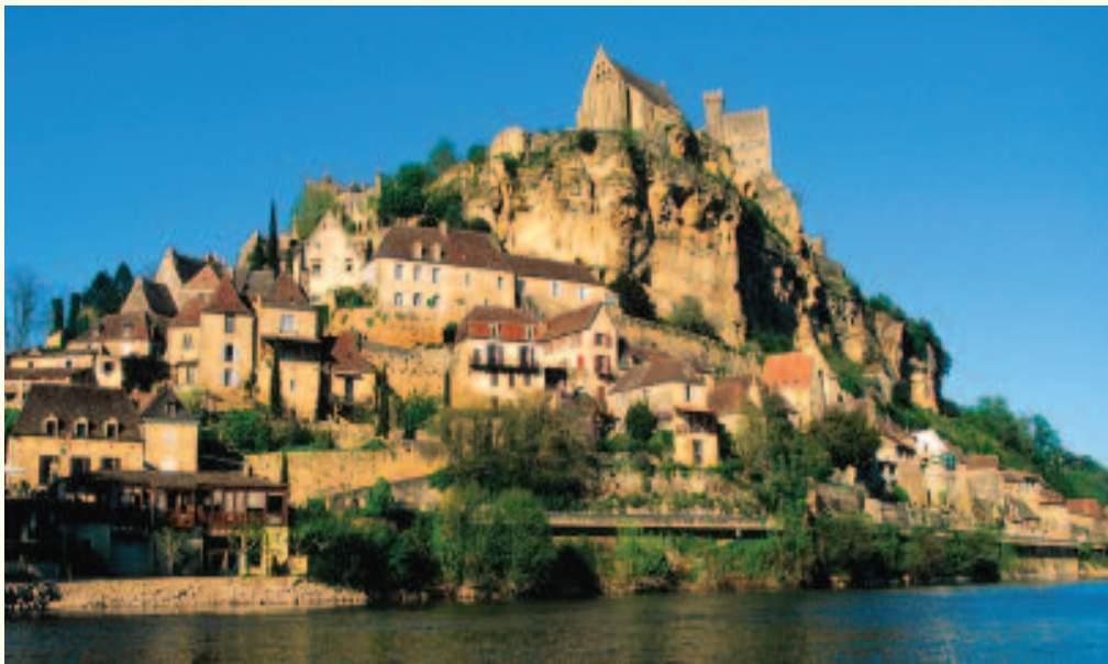
Visit the fortress of Beynac-et-Cazenac, which soars dramatically above the Dordogne River valley. Once a stronghold of Richard the Lionheart, it remained a highly prized strategic outpost for centuries.