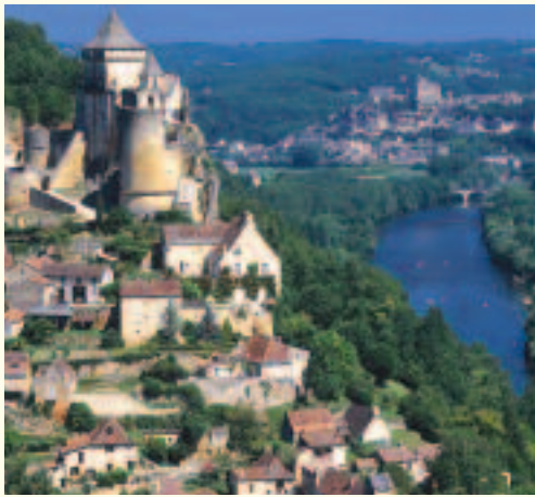
See the fortress of Château de Castelnaud which has towered above the Dordogne River valley for 900 years.