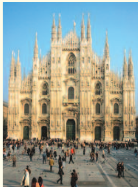
Visit Milan's towering Duomo, home to some of Italy's finest religious art.

This bustling city is one of Europe's preeminent centers of commerce, culture and fashion. The Duomo and the Teatro alla Scala are splendid medieval landmarks just steps away from the Galleria Vittorio Emanuele II, a world famous shopping plaza. Expanded numerous times throughout the Renaissance, the Duomo is one of the largest churches and most striking Gothic structures in the world. It features an incredibly ornate exterior embellished by more than 2,000 sculptures and is topped with a sea of elaborate spires and towers. Milan is host to some of the finest Renaissance art, including Leonardo da Vinci's masterpiece, The Last Supper .