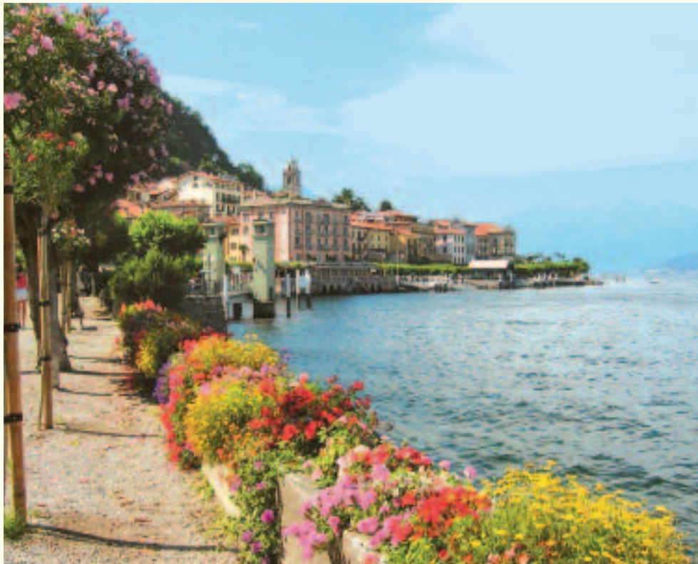
Experience Bellagio's magical combination of splendid architecture and panoramic views of Lake Como and the surrounding snowcapped Alps. Inset: Statue at Villa del Balbianello.

Unpack once upon arrival for this exceptional travel program that includes all accommodations, exclusively arranged excursions and most meals at an incredibly attractive price. Come experience a special way of living: VILLAGE LIFE IN THE ITALIAN LAKE DISTRICT.