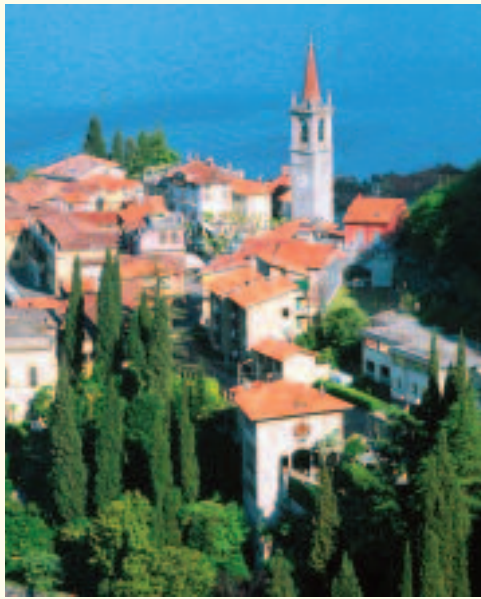
Varema's breathtaking lakeside setting, perfectly manicured gardens and elegant villas make it one of the most romantic villages in Italy.