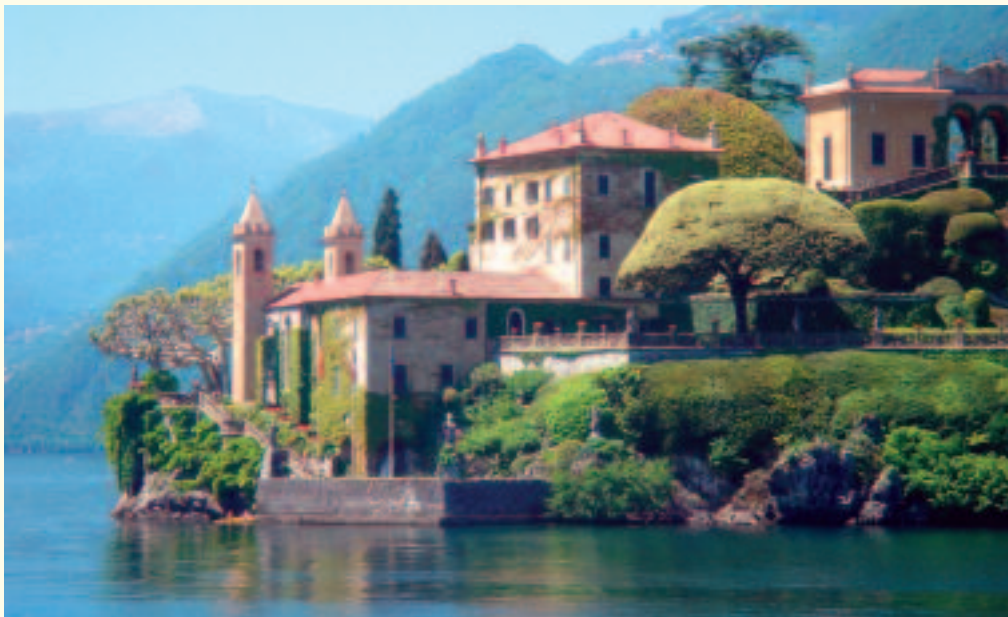
Nestled on the shores of Lake Como and surrounded by majestic alpine peaks, the legendary Villa del Balbianello has one of the most beautiful and dramatic settings in all of Italy.