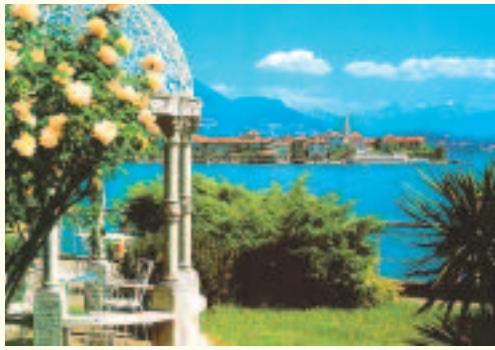
Crystal clear lakes, Alpine views and grand villas define the beauty and charm of Lake Maggiore.

PRSR STD U.S. Postage PAID Gohagan & Company