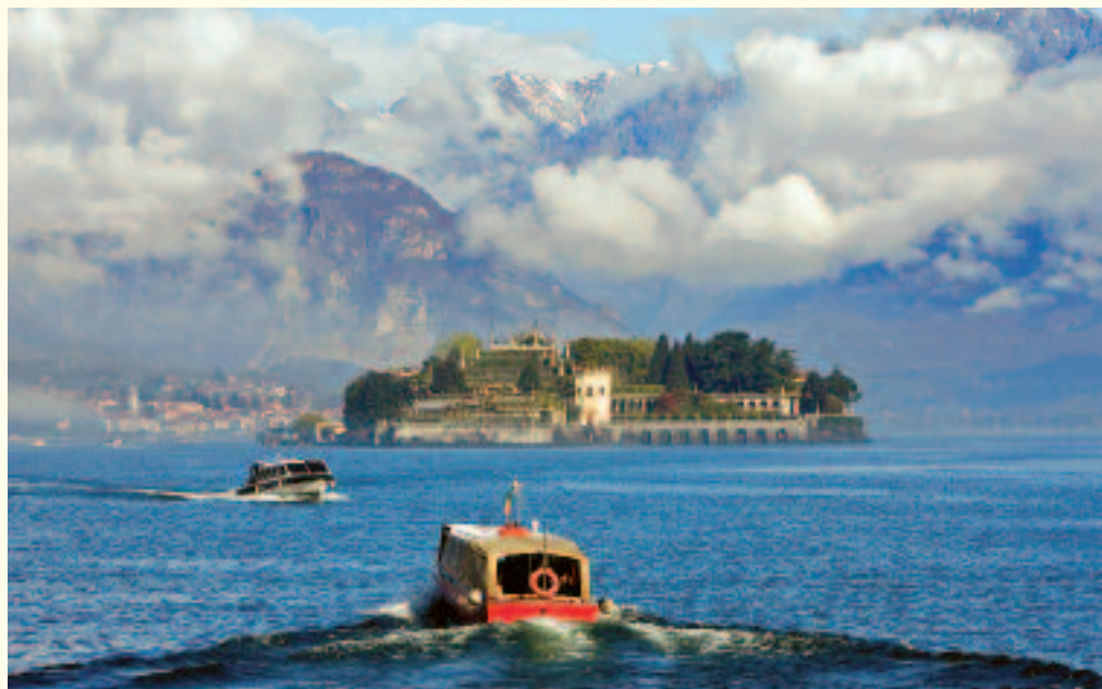
Isola Bella once was nothing more than a small rocky island in Lake Maggiore; visit its opulent 16th-century Borromeo villa and stroll through some of the most beautiful gardens in the world.

Just across the lake stands Villa del Balbianello, a romantic's dream set on a steep promontory overlooking the bays of