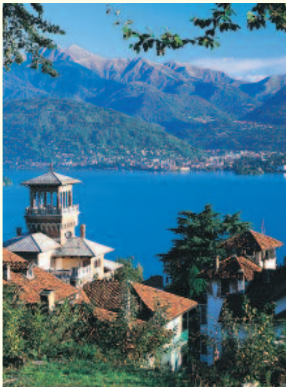
A stay in the beautiful town of Stresa on Lake Maggiore left an indelible impression on a young Ernest Hemingway.

The aristocracy of the 18th and 19th centuries regarded the Lake District an essential part of the "Grand Tour" of Europe, considered necessary for a complete education at the time. The region's gorgeous settings and unsurpassed artistic heritage also made it a favorite destination and a source of inspiration for some of Western Civilization's greatest philosophers, writers and musicians from Virgil and Puccini to Byron and Hemingway. All came to love this uniquely beautiful and romantic corner of Italy. So will you, as you explore the Italian Lake District's natural and artistic treasures for yourself during this enchanting travel opportunity.